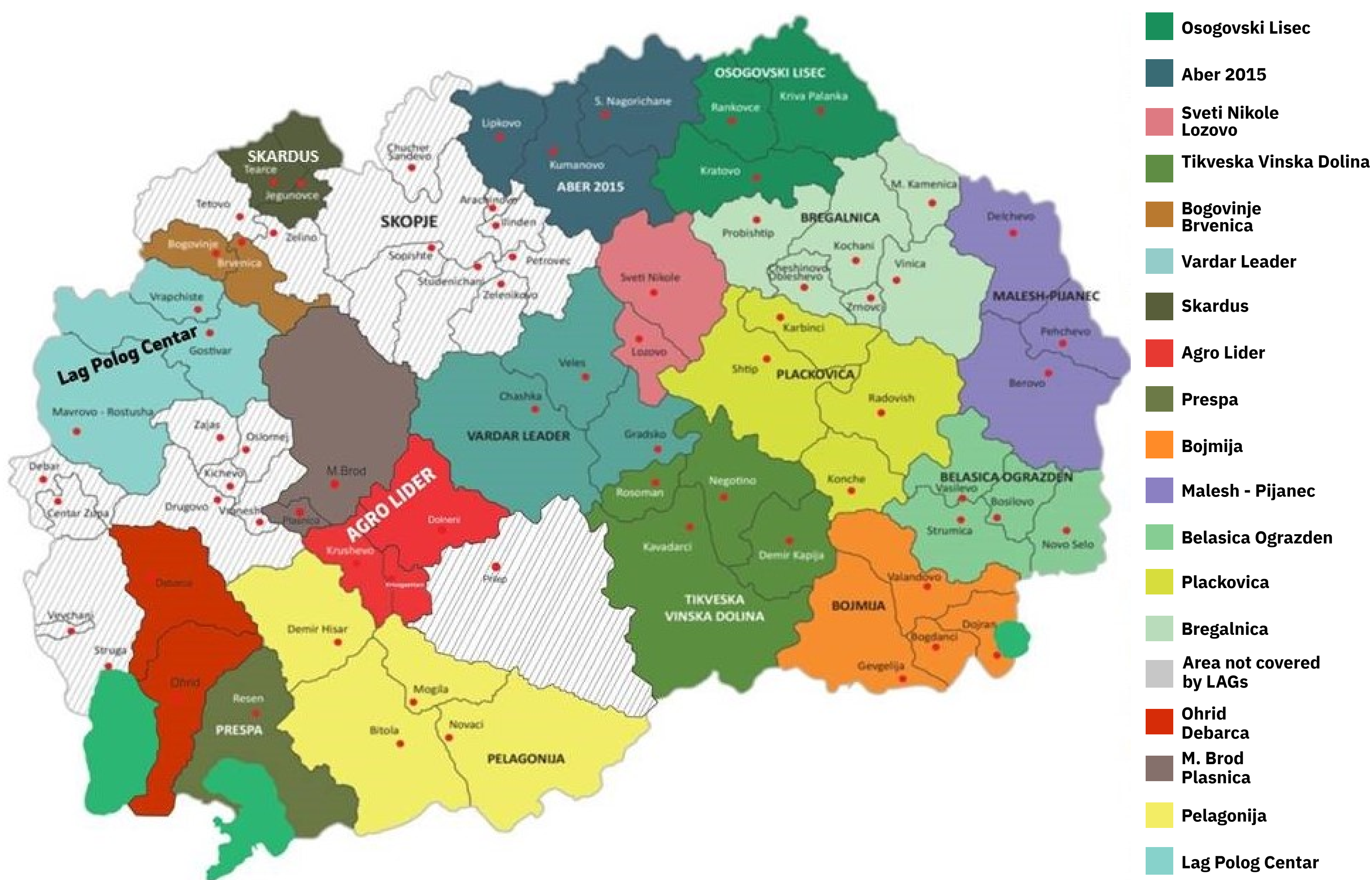
Figure no.2: Map of local action groups and LAG initiatives in the Republic of North Macedonia

In May 2018, MAFWE issued enlistment decisions for 13 LAGs that fulfil minimum criteria to obtain the status of local action groups and be entered in the Single Registry of Local Action Groups at the Ministry of Agriculture, Forestry and Water Economy.[36] They are: